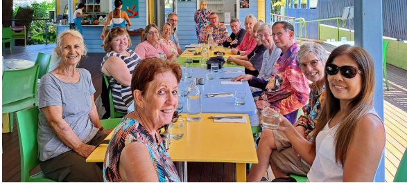
Cockle Bay gave us the chance to explore and enjoy the lovely day.