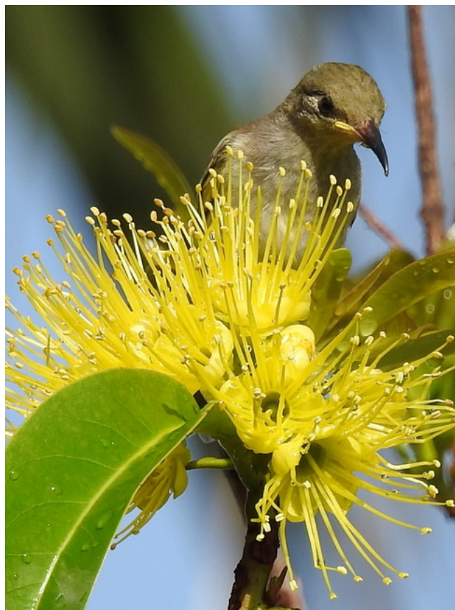
Brown Honeyeater on Golden Pinta