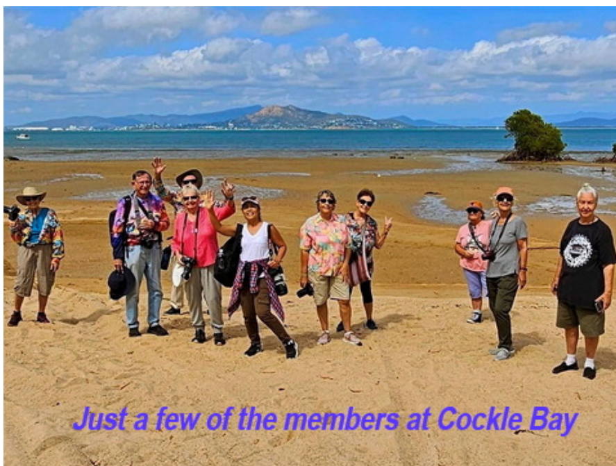
Just a few of the members at Cockle Bay