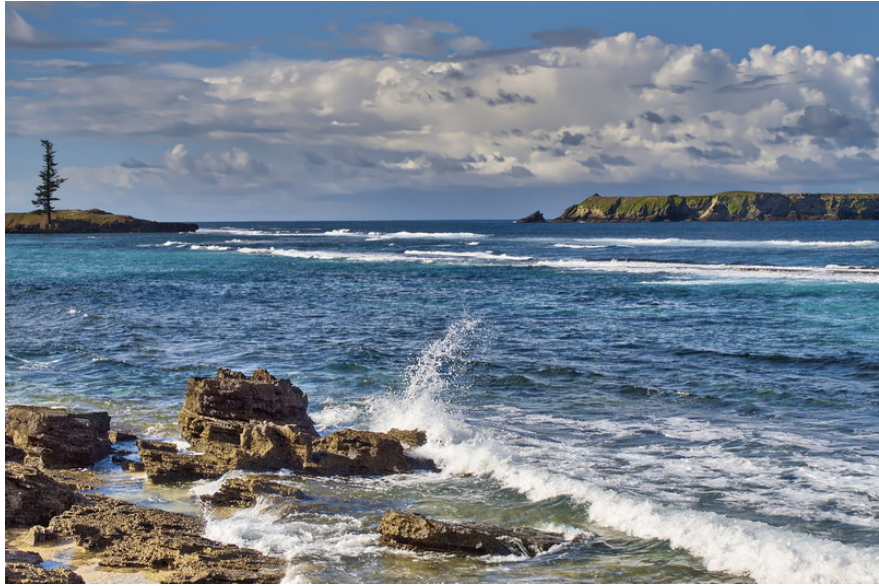
PRINT OF THE MONTH Theme — Scapes What a View — Cecily Jones