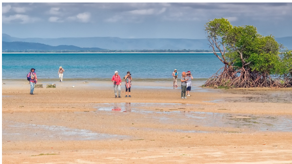
Some of the group at our Photography Workshop.