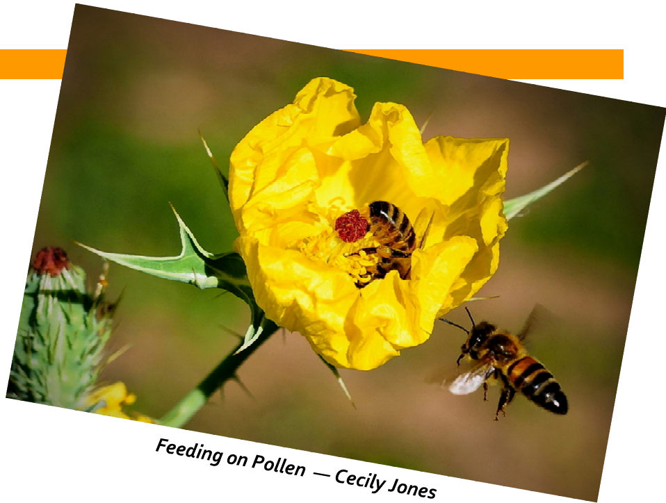
Feeding on Pollen — Cecily Jones